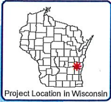
Project Location in Wisconsin